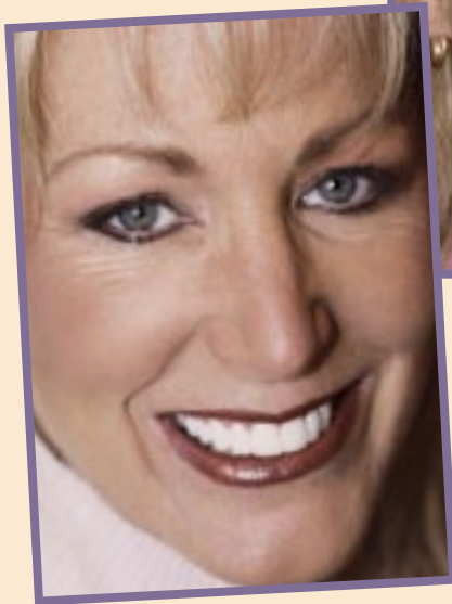
Modern crowns & veneers turn a smile into ... a SMILE!

And the bonus: avoid the premature wrinkles and age lines that may accompany an altered bite. Your smile will look even more attractive!