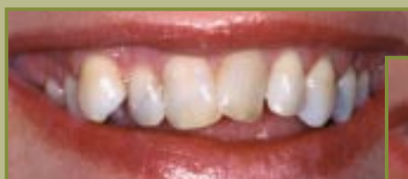
orthodontics & veneers